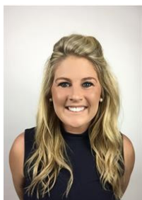
Lucy Martin Jenkins

PRIME LOCATION!!! Opportunities like this don't come around very often—2.39 acres located off exit 94 of I-64 in Winchester. The property runs parallel to Interstate 64 with east and west-bound lane visibility. Suitable for commercial or highway-related businesses. Currently zoned A-1 (4 bd/2 bath home on property), the sellers will have the property re-zoned prior [...]