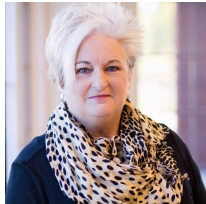
Margaret G Gray

Deerfoot Valley-Lot #5 Old growth timber and a stunning view highlight this lot. Located approx. a mile from Hal Rogers Pky. and just minutes from downtown London and I-75. Country living with subdivision amenities. (Owner/Agent)