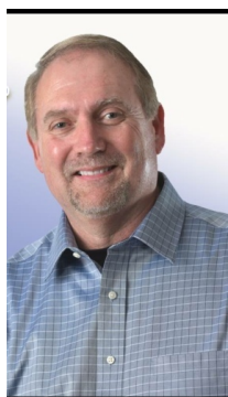
Greg E Wood

Looking for a quiet piece of Clark County countryside to call your own? Look no further. This building lot is in a comfortable area of the county just far enough out to be considered country, but not so far that you feel out of touch. Several lots available.