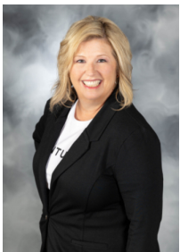
Ronda D Tipton

Seller is offering 0% interest owner financing with two payment options. This stunning 73+ acre parcel of land located in Burnside, Kentucky boasts close to three miles of breathtaking water views along the Cumberland River, making it an ideal location for a residential development or commercial property. The property is conveniently located near the Burnside [...]