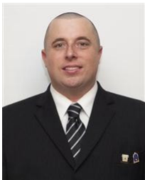
Shawn W Rogers

Lot 29 in Lake Point Estates. This property is ready for your new construction. Located close to Laurel Lake, and convenient to town!! call for details.