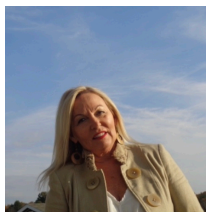
Donna S Cheek

Beautiful Views 7.82 acres. This is Tract 8 off Mount Zion Rd located in cul-de-sac entrance. Property is restricted to built homes or new manufactured homes of 1200 SF or more. This was a larger tract that has just been divided so will go fast!