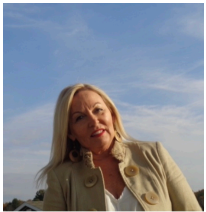
Donna S Cheek

Beautiful Mainly Level 7.25 acres with great views. This is Tract 6 off Mount Zion Rd located in cul-de-sac entrance. Property is restricted to built homes or new manufactured homes of 1200 SF or more. This was a larger tract that has just been divided so will go fast!