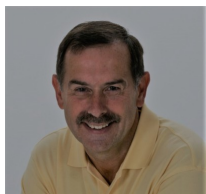
Dwight A Conway

Beautiful tract to build a home and have a mini farm near Taylorsville Lake. Great area for wildlife and fishing. Deed restrictions of No mobile homes. Agent's wife is a heir to this estate.