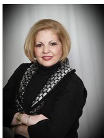
W Jean Angel

Property located in the City Limits of Williamsburg. This property would be great for building your future home or even suitable for apartment buildings. City water and Sewer available. Buyer to verify acreage.