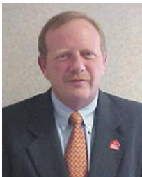
C Wayne Burns

Commercial zoned 4-UC 1.16 acres corner of 1617 and 21 NEW By-Pass intersection. Sold with 1802A 1.51 acers. Total of 2.64 +/- acers. $250,000 for both lots. 9000-11000 cars per day. 1.9 miles from historic Boone Tavern and Berea College campus. Retail, Convenience Store, Auto parts, Bank, Professional Services building (Doctor, dentist, Insurance office), storage [...]