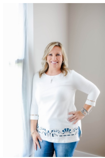
Shannon V Malone

Ready for your house, cabin, doublewide, tiny home, barndominium..... the only limitation is your imagination! 1.5 acre building lot with no deed restrictions. Utilities and septic are present on the lot. Access from Brown Ridge and Gilliam Road. Paved driveway. Seller has no knowledge of condition of septic system.