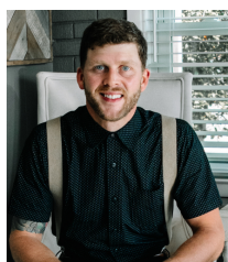
James T Wilson

141 acres of wooded lakeview property located on beautiful Lake Cumberland. This is a prime hunting location with a natural water source. Ideal for recreational activities and is accessible by vehicles. It has improvements such as gates, roads, culverts, and multiple clearings throughout. There is a cave system on the property. Adjacent to the established [...]